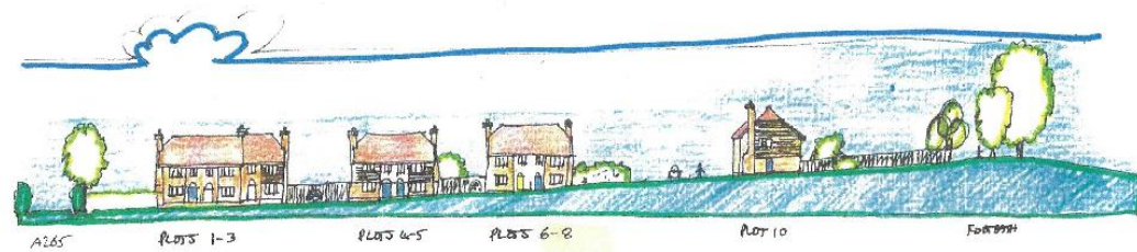
SITE SECTION NORTH-SOUTH VIEWING EAST