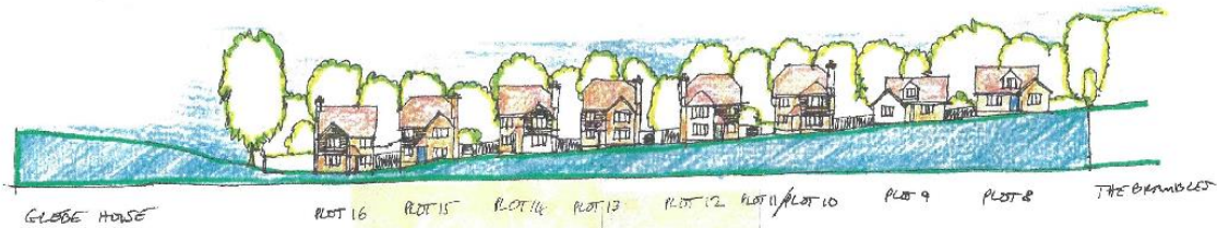
SITE SECTION EAST-WEST VIEWING SOUTH

LAND ADJACENT GLOBE HOUSE BUNWASH ALSDY + WALTER LTD 02493.05A